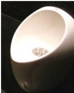
Uridan Oil Barrier Urinal